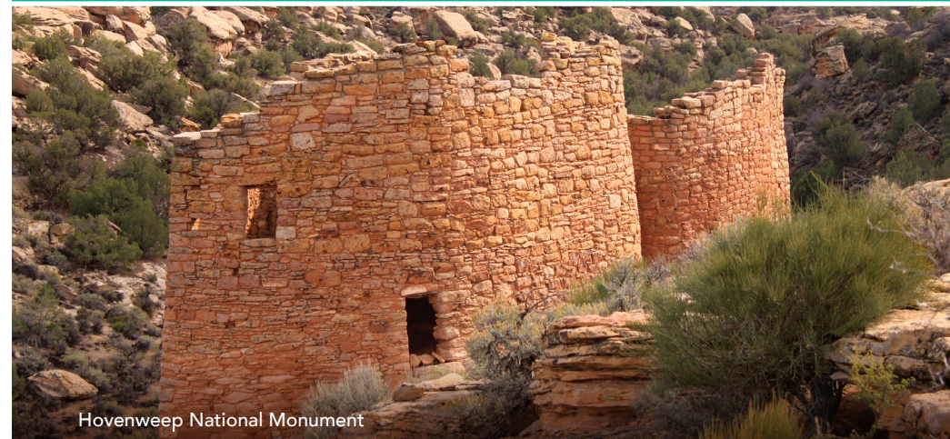
Hovenweep National Monument