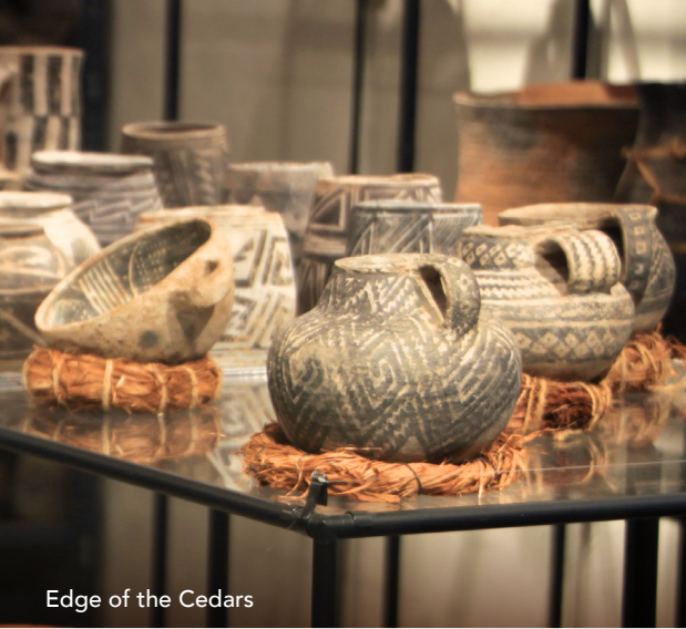
Edge of the Cedars