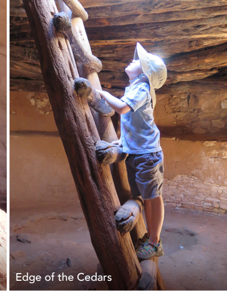
Edge of the Cedars