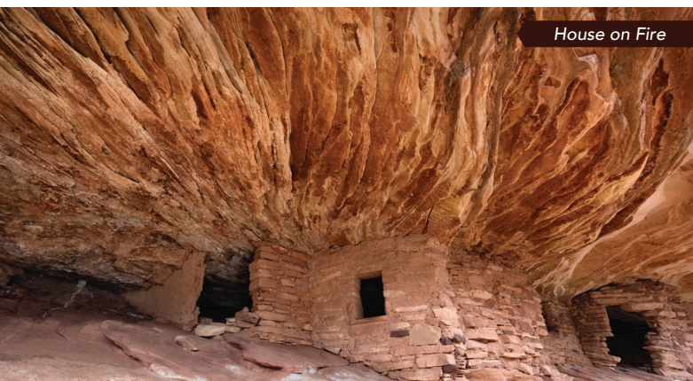
House on Fire

House on Fire is the first archaeological site located along the trail in the South Fork of Mule Canyon. To capture the picturesque flames above the house, it's best to do this hike in the late morning when the light reflects off the opposite wall of the canyon. Continuing past House on Fire, several additional archaeological sites can be seen. Some are easily accessible and others can be viewed from the trail as they are nestled high in the canyon walls. The trailhead for this hike is located on County Road 263 just off Hwy 95. (Fee area, day-use permits available on recreation.gov or at the trailhead)