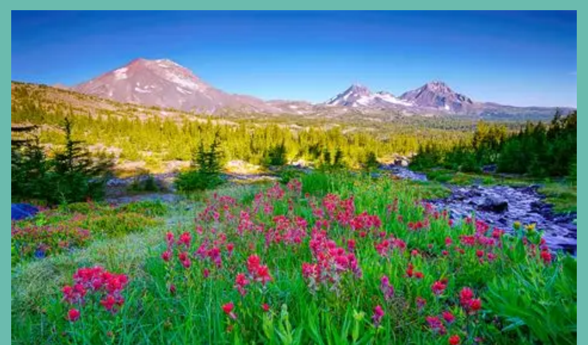
Three Sisters, OR