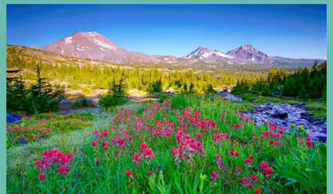
Three Sisters, OR