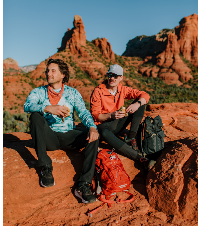
Photo stop at Airport Mesa Scenic Overlook