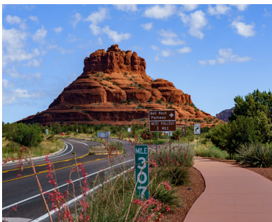
Photo stop for the great views of Bell Rock, Courthouse Butte and more.